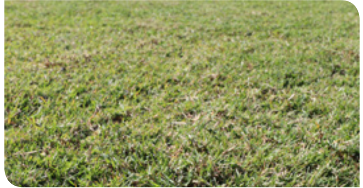
'Grand Prix' turf