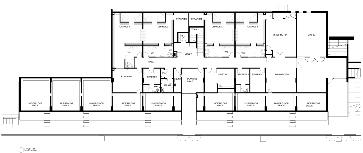
Grandstand lower level floorplan

These upgrades provide vastly improved conditions for players and spectators, and will offer an attractive option for hosting regional and state events in the future.